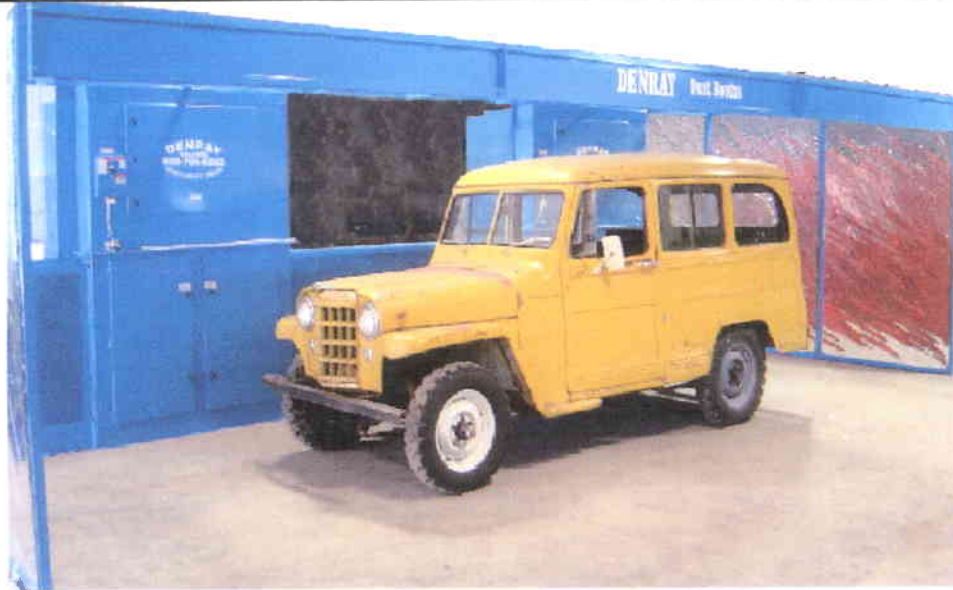
*28' BOOTH WITH 2 POWER UNITS PICTURED*

ARE YOUR ITEMS TOO BIG FOR A DOWNDRAFT TABLE?