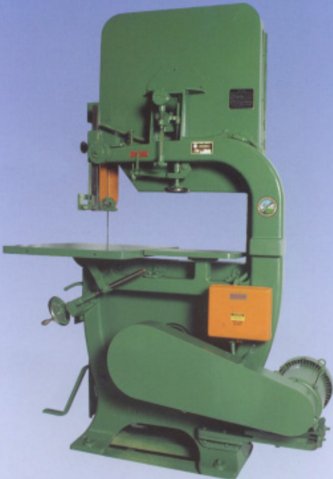
Rear view of 32" Heavy-Duty Bandsaw showing Belt Drive configuration.