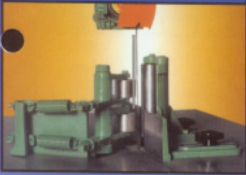
Single Roller Resaw Fence