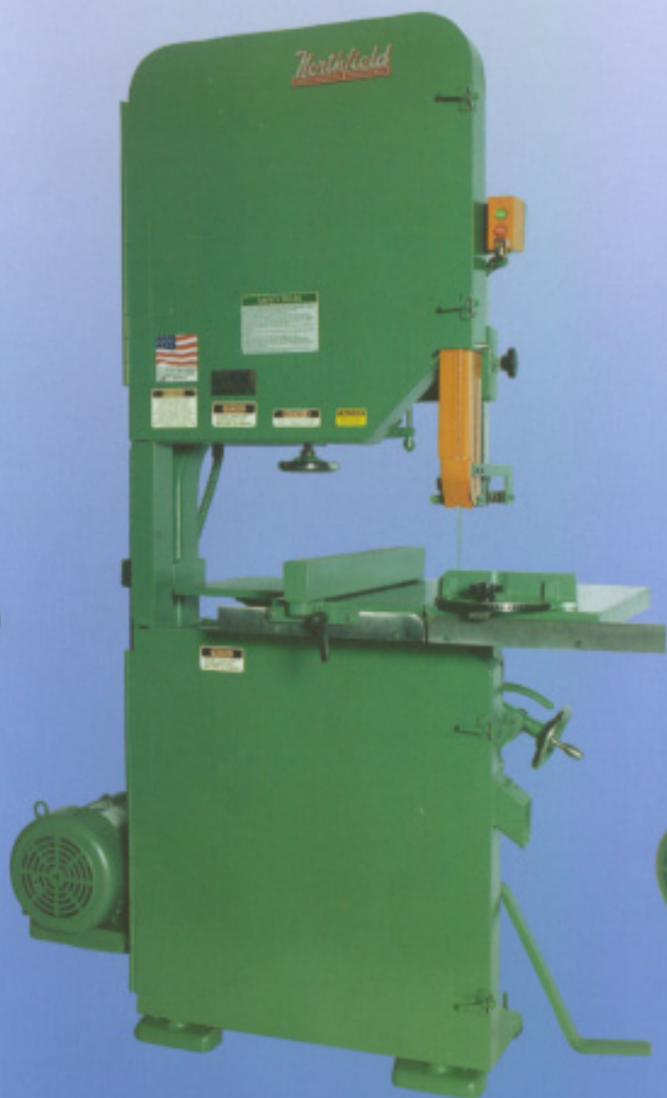
27" Belt Drive Bandsaw with double face rip fence and large cross cut gauge