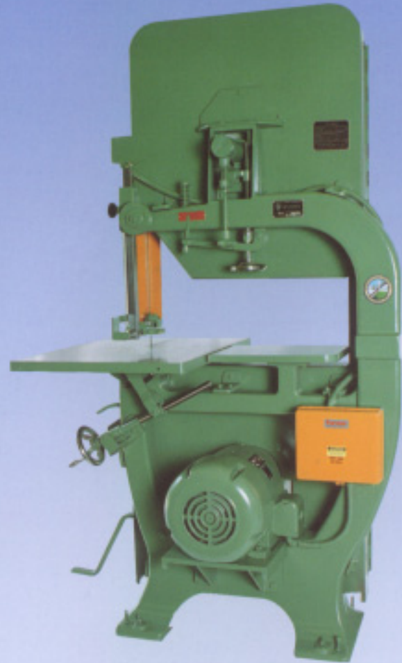
Rear view of 32" Heavy-Duty Bandsaw showing Direct Motor Drive configuration.