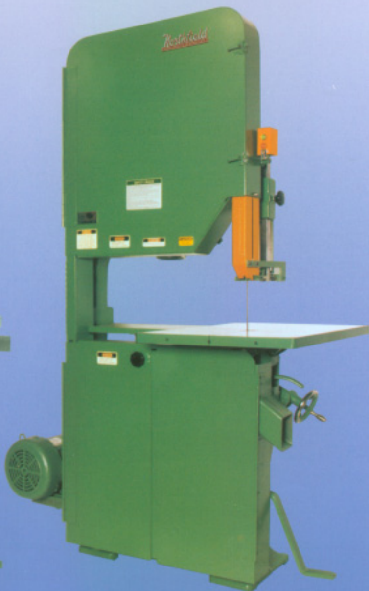
32" Belt Drive Bandsaw

Advanced Bandsaws for the Wood, Plastic and Metal Industries