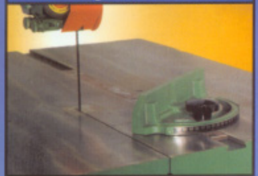
Miter Gauge with Dovetail Slot