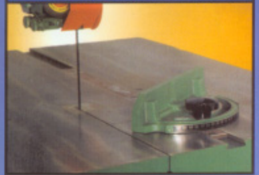
Miter Gauge with Dovetail Slot