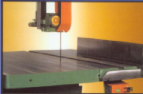
Single Face Rip Fences (left & right)