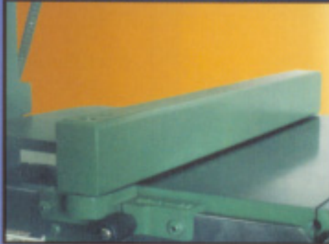
Double Face Rip Fence