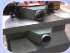
Two Dust Outlets