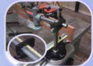
Coping Table with Eccentric Holddown, Fence & Flip Stop