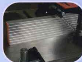
Optional Aluminum Fence Plate