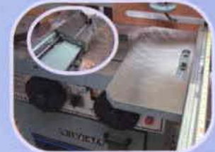
Cast Iron Frame and Table