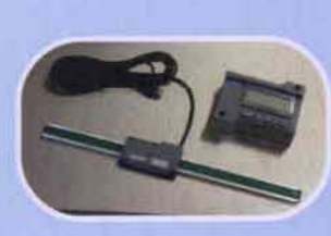
Optional Proscale Digital Scale for Spindle Height