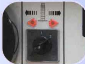
Spindle Reversing Switch