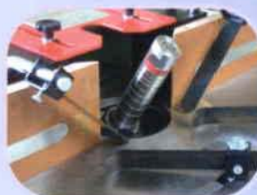
Optional Tilting Spindle (V.05 only)