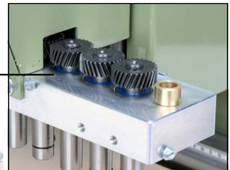
Steel Heat Treated Helical Gears