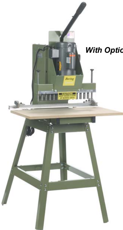
With Optional Stand