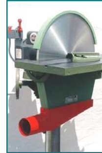
Shown with Optional Dust Shroud