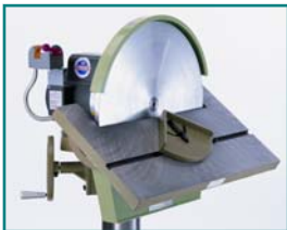
45° Down Tilt