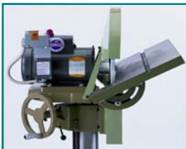
35° Up Tilt